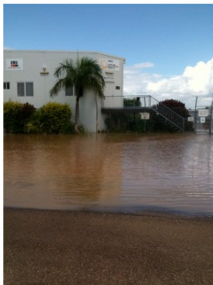
Another angle of Capricorn Helicopter Office