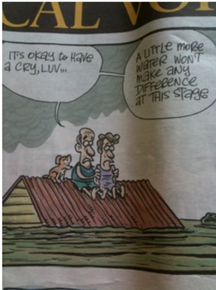
IMG_0301 Cartoon in Morning Bulletin 03.01.2011