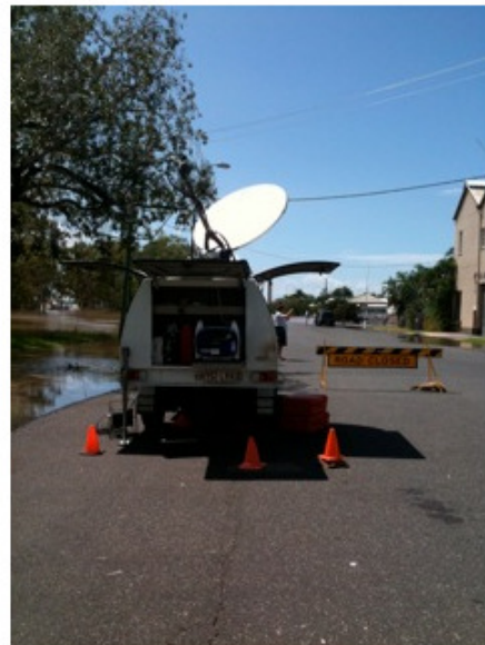
IMG_0316 ABC mobile studio on Quay Street