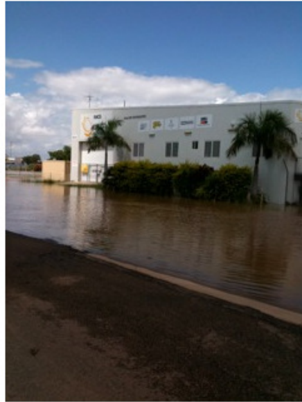
IMG_0317 Rescue Helicopter Headquarters in the surrounds of the Rockhampton Airport