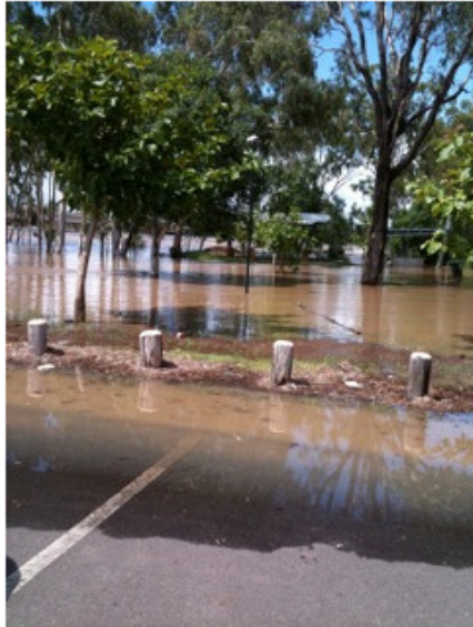
IMG_0306 Park area along Glenmore Road just near the Railway Bridge- Taken today