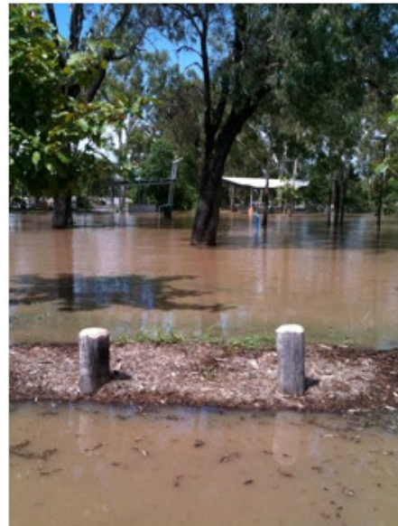
IMG_0307 Another angle of the park