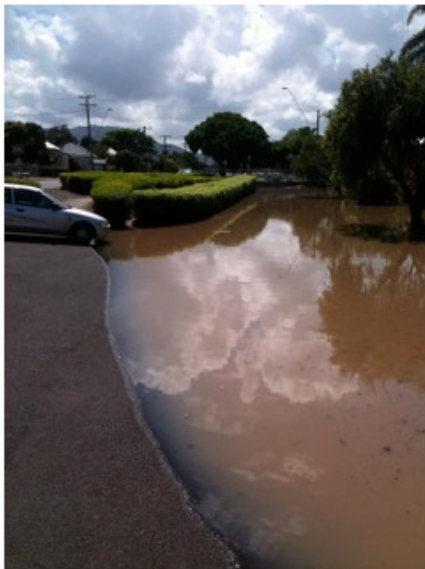
the road from Council Caravan Park Driveway of Service Station across