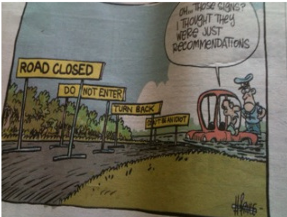
IMG_0302 - Another cartoon 03.01.2010