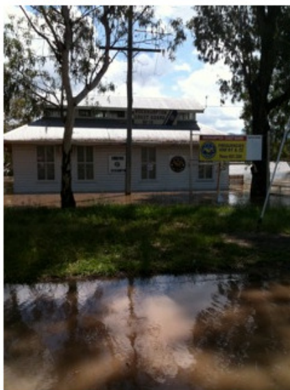
IMG_0313 Coast Guards office on Quay Street