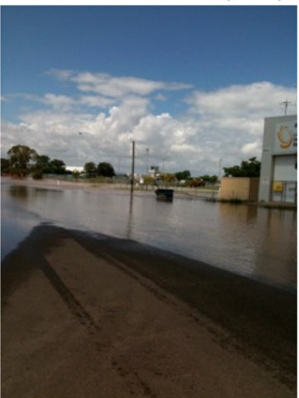
The road leading towards the airport