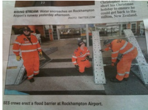
IMG_0304 - Barriers being constructed around terminal