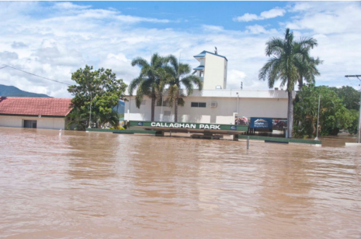
A day at the Race Course (06 Jan)- continued..