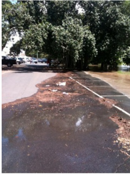
IMG_0311 Water starting to approach onto road in Quay Street - down from the ABC studio