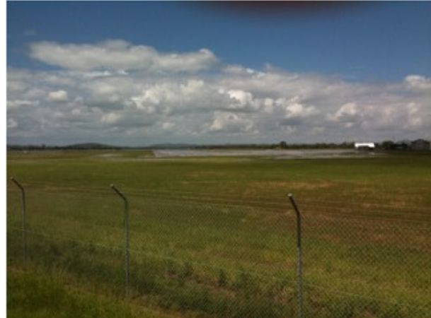
Looking towards the run way taken from roof of car. Another shot of runway