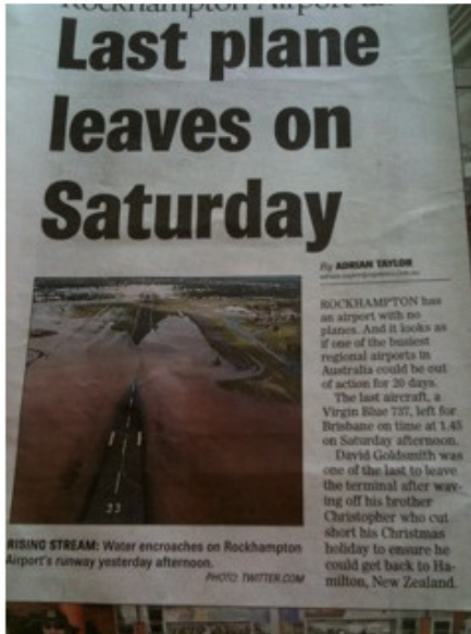
IMG_0303 News article taken from Morning Bulletin