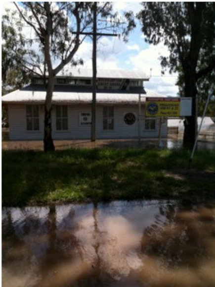
IMG_0313 Coast Guards office on Quay Street