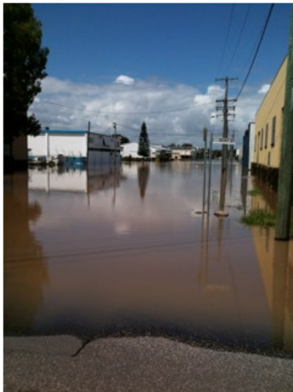
IMG_0312 Standing at the cnr of Quay and Stanley - looking back up to East and Bolsover Streets