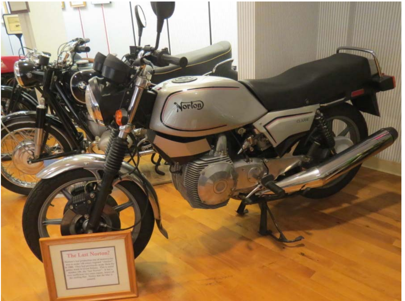
The Last Norton? Norton's last production line of motorcycles was the model 1000cc "Classic" which was produced until 1986. They had previously made bikes for 100 years. The last Norton was the "Last Norton" of 1986. It had a number 100, the "Last Norton". Many of the production line were signed. Many of the models that "Survive" than the 1000cc.