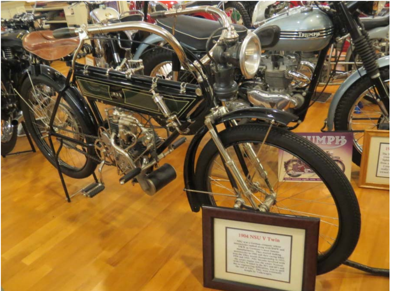
1904 NSU V Twin NSU was a German company whose motorcycles ranked along with BMW and DKW as Germany's three main manufacturers. They started making bikes in 1898 and their racing bikes won the 1904 world championship in 1911, 1914 and 1915. NSU became involved with the Harley-Davidson Co. in 1929 and was the only Harley-Davidson licensee in the world until the end of 1931. They were eventually bought by Volkswagen.